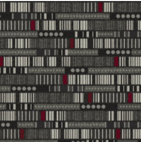
89580 Vibe 167 hidden edge color